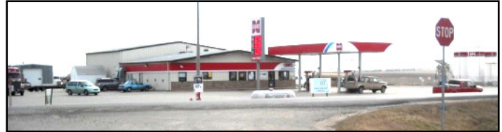
Parshall Cenex C-store

Unique about our company: We are one of the communities in Mountrail County in the midst of the “Bakken” formation and the oil boom that is growing fast and furious. Our sales have increased tremendously in the last few years and are still growing. The traffic and influx of people in the area have really put a strain on our infrastructure and way of life. Oil wells have changed the landscape forever! The city of Parshall was recently featured as part of a mini-series on The Discovery Green Channel called “Boomtown”