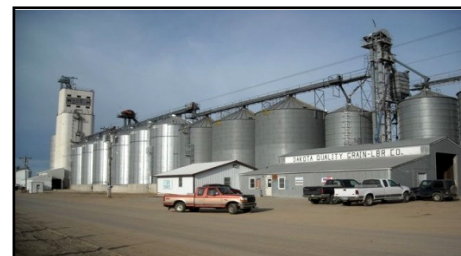
New Town Location