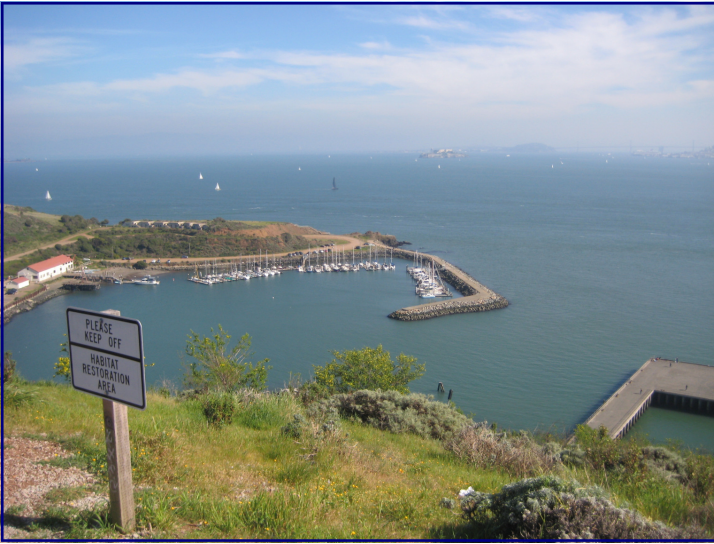
City Tour—Sailboat harbor as seen from Golden Gate Bridge lookout point