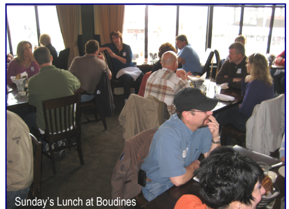
Sunday's Lunch at Boudines