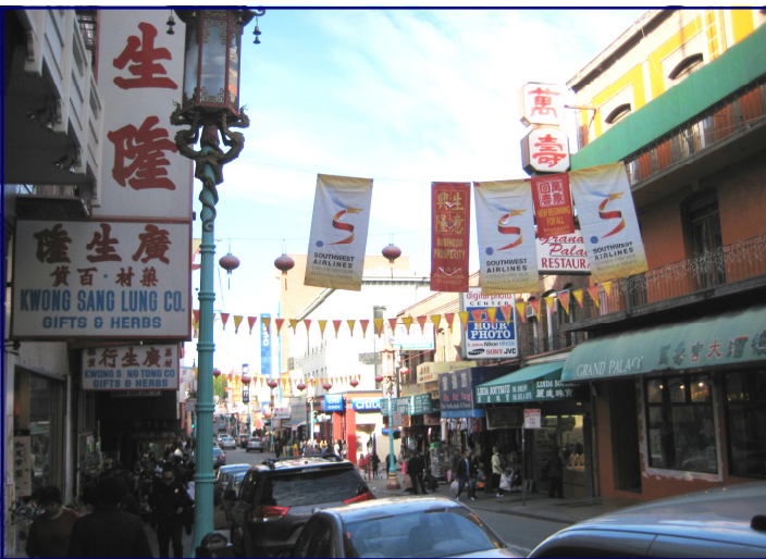
Attendees spent about an hour shopping in Chinatown during the pre-conference city tour on Sunday.