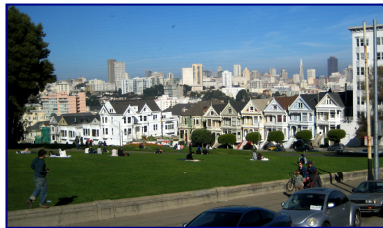
City Tour - Do you remember the TV show "Full House?"