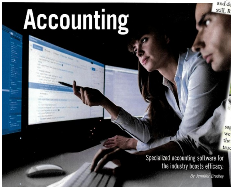
Specialized accounting software for the industry boosts efficacy.